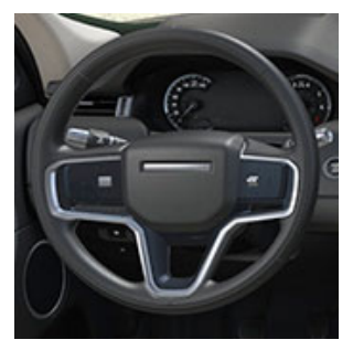
SEATING AND IN-TERIOR TRIM